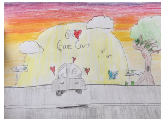
"Care Cars"