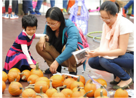
Fall Festival 2016

The first annual gala of CAAMNY will take place around the Chinese New Year of 2018. This would be the major fundraising event, and it will benefit the RB Children's Foundation. We are recruiting volunteers who have experience in fundraising and organizing special events.