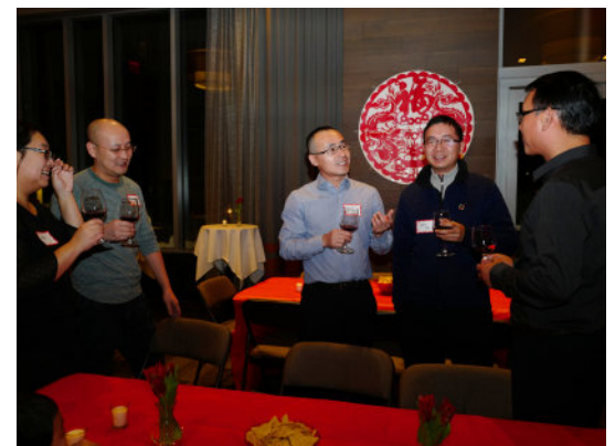
Chinese New Year Party 2017